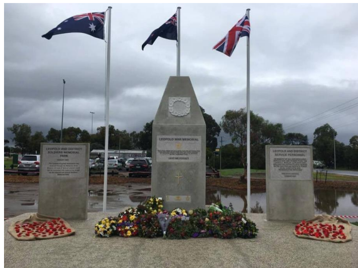
Leopold War Memorial