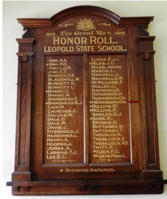
Leopold State School Honour Roll