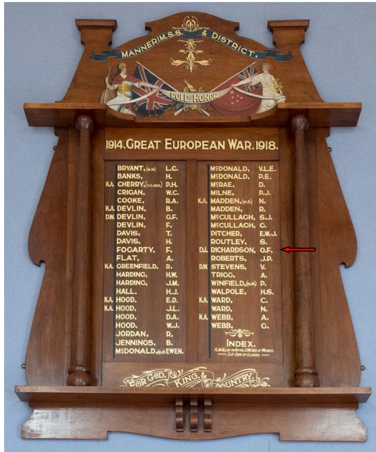
Mannerim State School & District Roll of Honor