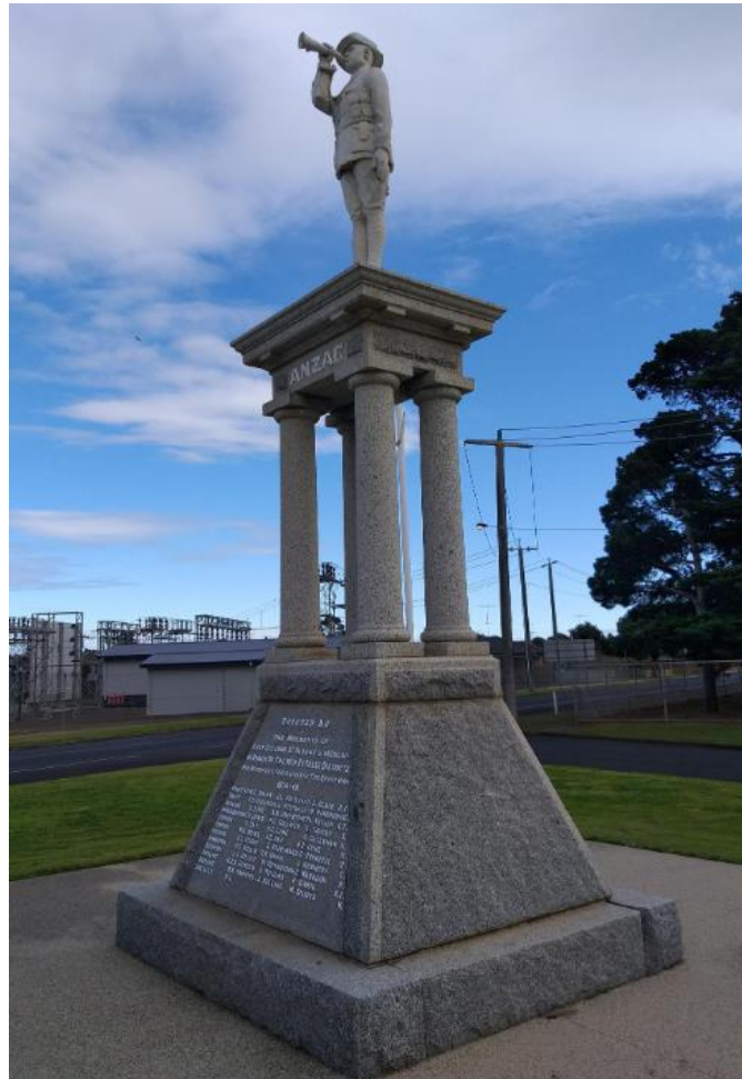
East Geelong, St. Albans & Moolap War Memorial