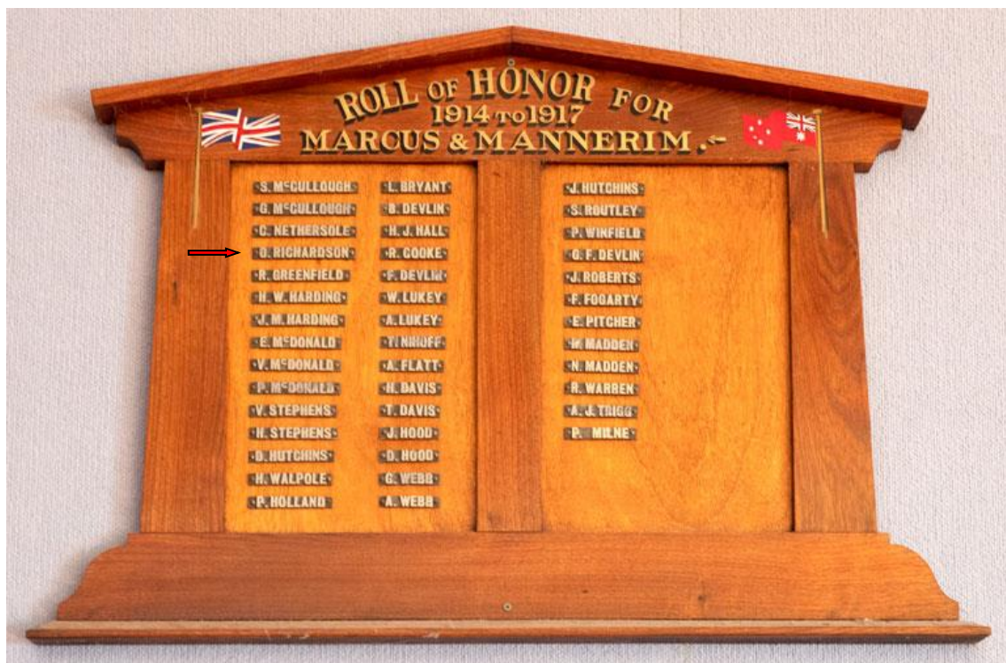
Marcus & Mannerim Roll of Honor