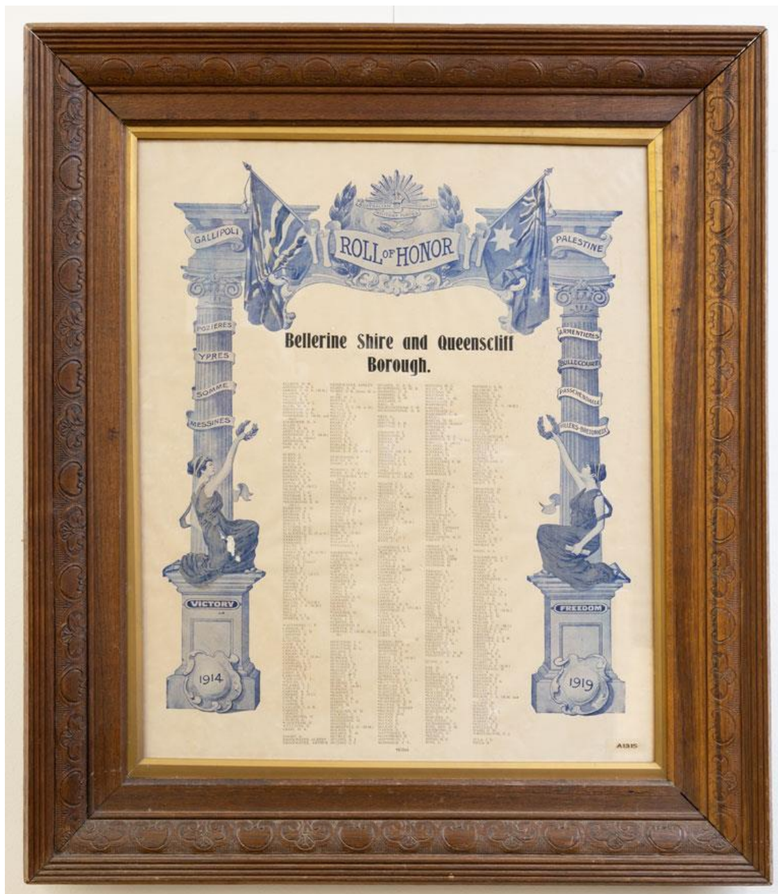
Bellarine Shire & Queenscliff Borough Roll of Honor