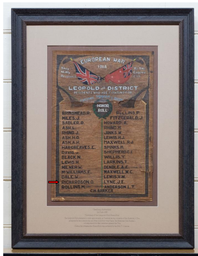
Leopold & District Residents Honor Roll